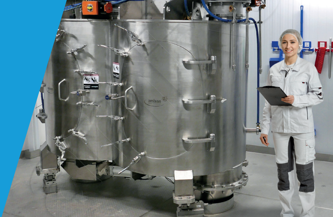
amixon® Vertical Twin-Shaft Mixer HM